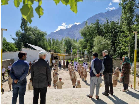
An experience is the 'silent' morning assembly