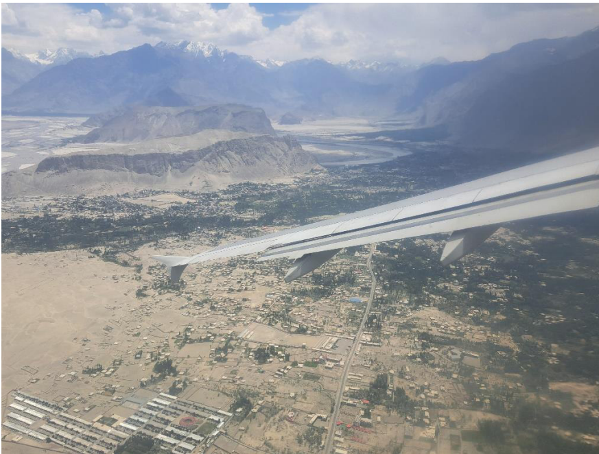
Approach to SKARDU located 2,500 m above sea level